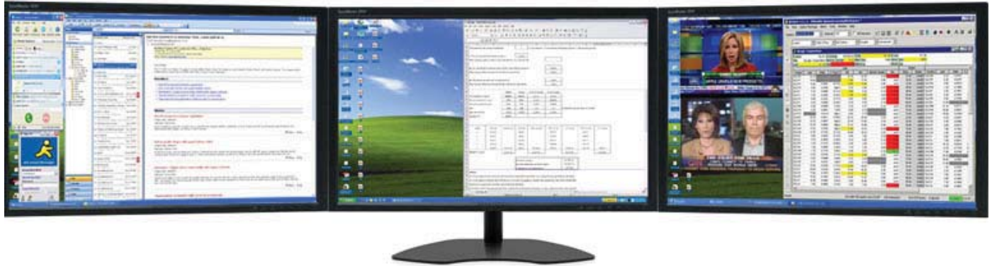
CINEMASSIVE Trio 22W

Triple 22" Widescreen LCDs, fast response, outstanding value. New Low Price: $2,099