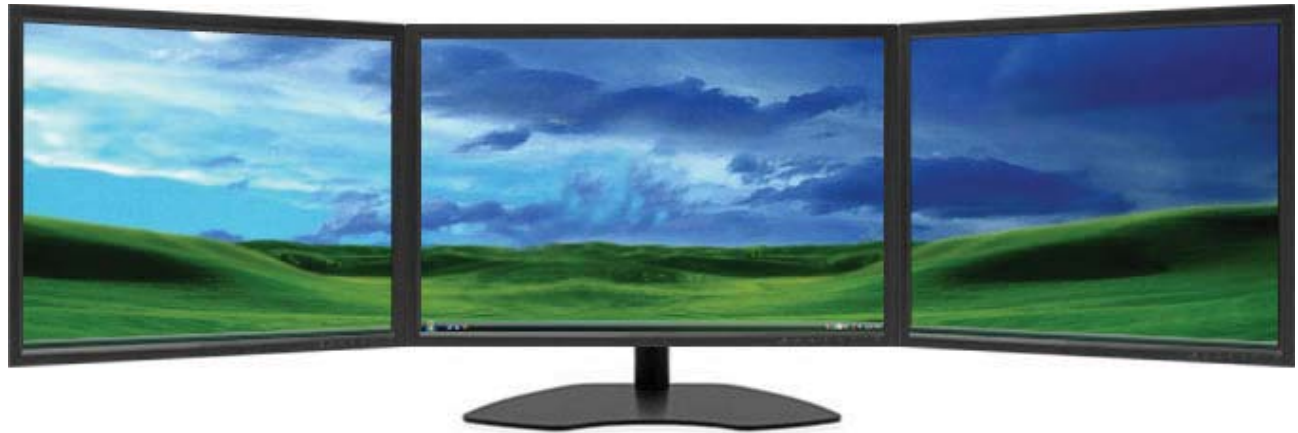
CINEMASSIVE Trio 22DX

22" Premium Digital Central Panel with Dual 19" Wings. Extremely versatile. New Low Price: $1,799.