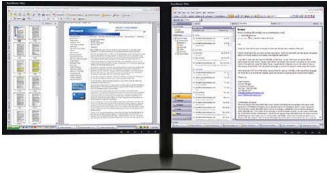
CINEMASSIVE Duo 19DS

Premium Dual 19" Digital DVI Displays. Best Available Viewing Angle. NEW LOW PRICE: $949