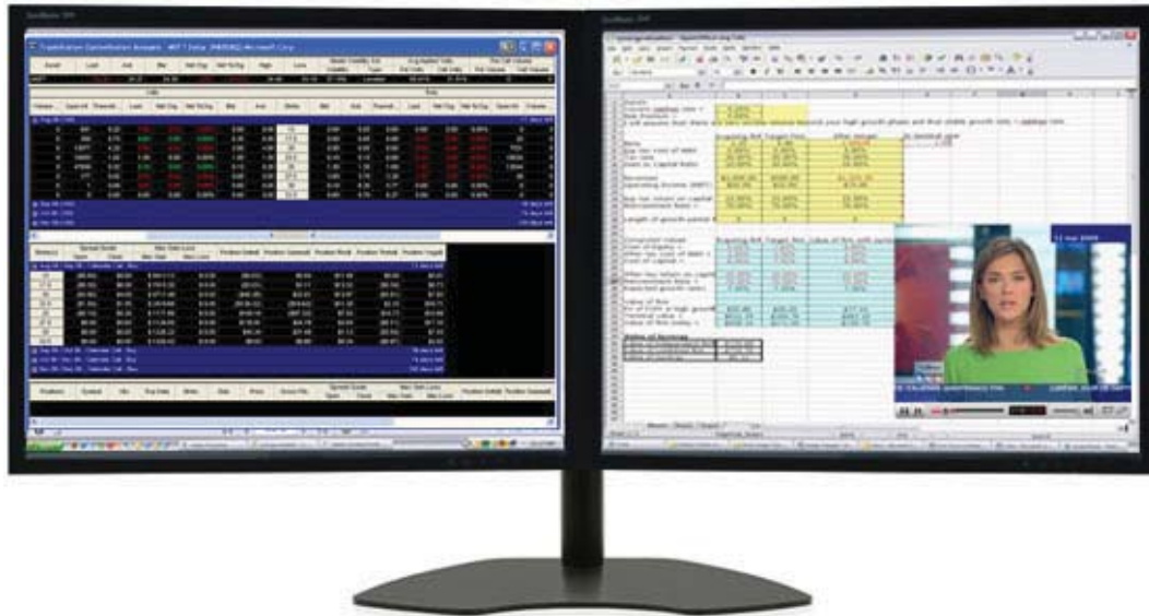
CINEMASSIVE Duo 19D

PREMIUM DUAL 19" DIGITAL DVI DISPLAYS, BEST AVAILABLE VIEWING ANGLE NEW LOW PRICE: $1,099